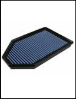
OE Replacement Air Filter