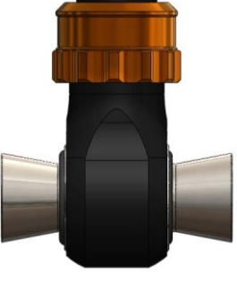
Rear Damping Knob

Start by adjusting the knobs in front to full stiff (clockwise) - a setting of 24 - and count down from there. For example, a setting of -10 in the front would be achieved by going to full stiff and backing off 10 clicks.