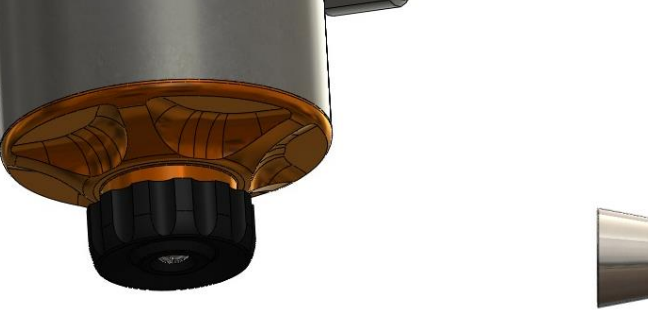
Front Damping Knob

There are 24 clicks of damping adjustment on the FRONT aFe Control Featherlight Coilover units and 24 clicks on the REAR Coilovers. The adjustment knob is located at the bottom of both the front strut and rear damper, shown below. The damping knob controls both compression and rebound damping together.