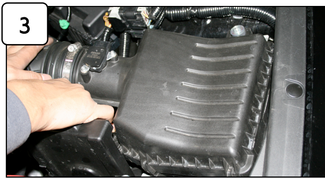
Disconnect MAF sensor harness. Unclip upper half of air box. Loosen clamps using 10mm socket or wrench. Pull crank case line away from tube. Remove upper half of stock intake.