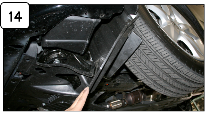
Secure front of vehicle on jack stands. Remove all driver side front plastic pins on bumper fender and inner fenderwell to pull back cover enough to allow removal of resonator air box. Wheel removal is optional.