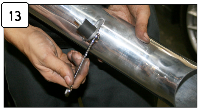
Install isolation mount to tab. Make sure isolation mount is positioned as shown. Tighten using provided nut and washer.