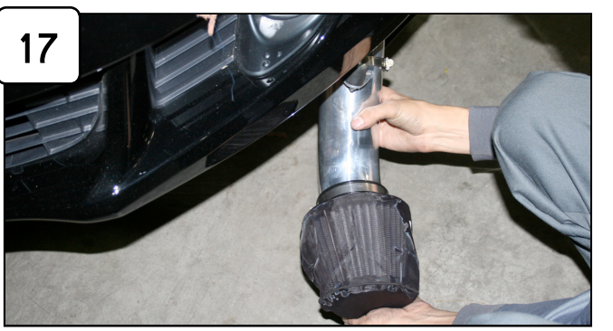
Install cold air tube assembly through bottom of vehicle. Position tube to short ram and isolation mount to hole next to battery. Tighten isolation mount using nut and washer provided and use 10mm socket or wrench. Tighten clamps using 5/16" nut driver. Re-secure plastic cover and pins from step 14.