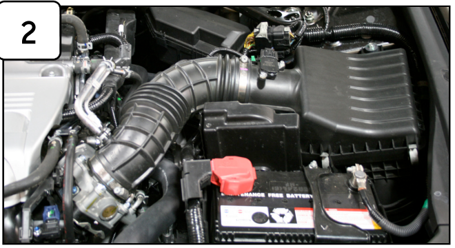
Complete Stock intake. Please disconnect battery terminals before installation. Do not attempt to install kit if vehicle is not cold!