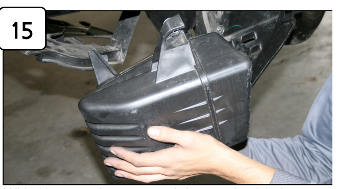
With 10mm socket or wrench loosen the 2 bolts holding in resonator air box and remove.