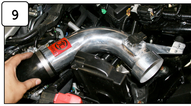
Install intake tube into vehicle and position tab to isolation mount and coupler.