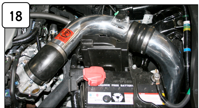
The installation of your Takeda performance intake is now complete. Please check all components and retighten if necessary. Thank you for choosing Takeda!