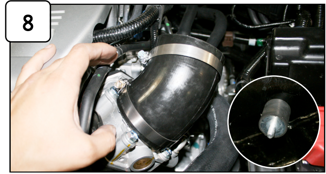
Install elbow coupler to throttle body and position using clamps provided. Do not tighten. Install isolation mount to threaded hole on inside of engine compartment.