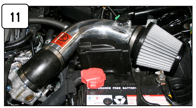
Install air filter to intake tube and tighten using 5/16" nut driver. Tighten all clamps using 5/16" nut driver. Your short ram intake is now complete.