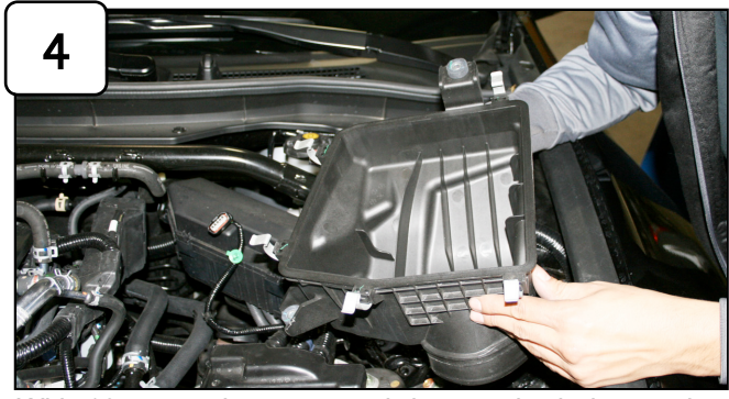
With 10mm socket or wrench loosen the bolt securing the bottom half of the air box and remove.