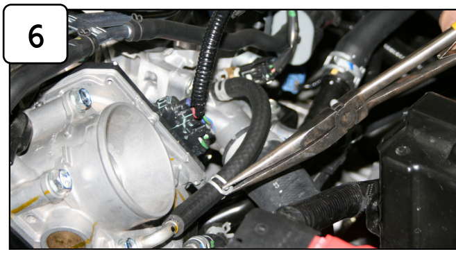
Replace throttle body coolant line with 5/16" hose provided and secure with clamps used from step 5.