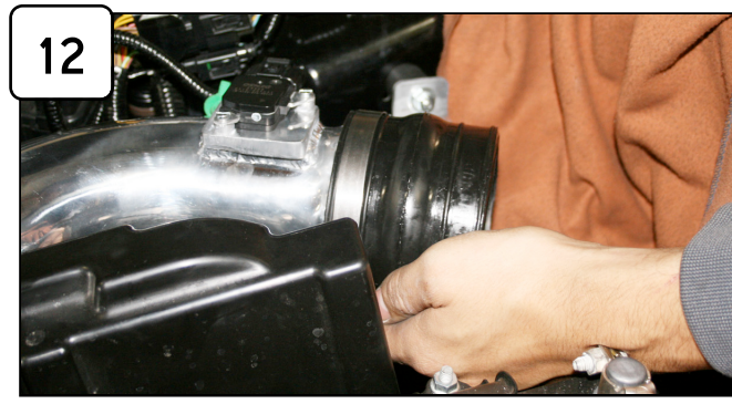
Remove air filter and install hump coupler with clamps to tube.