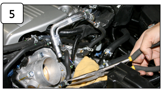
Remove crank case line attached with throttle body coolant line. Have a shop towel or rag handy to catch any leaking coolant. Use pliers to remove both lines. Save small clamps for later install. Caution: Coolant may leak from line when removing!