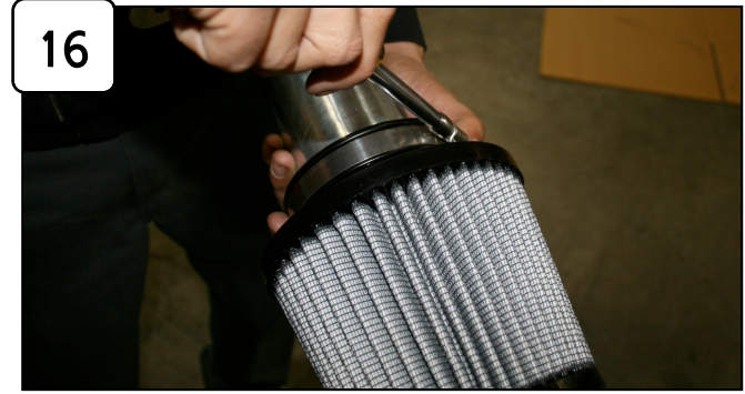
Install air filter and tighten using 5/16" nut driver. Attach pre-filter to fitler.