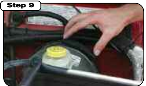
Looking straight at brake booster place center of isolation pad at 1 o'clock.