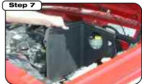
Prior to installing intake housing apply trim seal as shown to housing. Long piece to top edge and short piece lines hole. Place housing and mount. See step 8 for location(s).