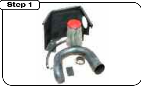
Complete kit with parts.