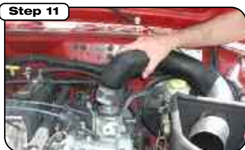
Slip coupler over throttle body.