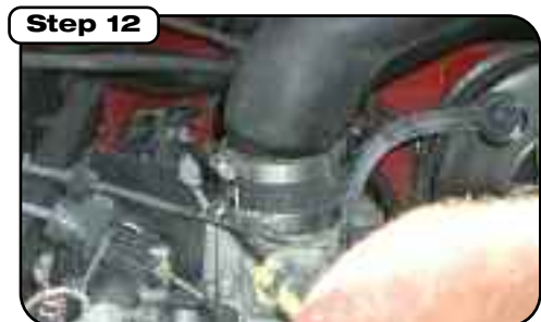
Install intake tube onto throttle body making sure tube is completely resting on throttle body to ensure proper hood clearance. Tighten clamps to secure tube.