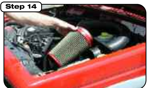
Install filter to intake tube and tighten clamp.