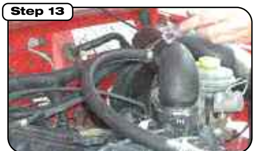
Connect supplied vent hose to nipple at intake tube and at breather vent tube and tighten clamps.