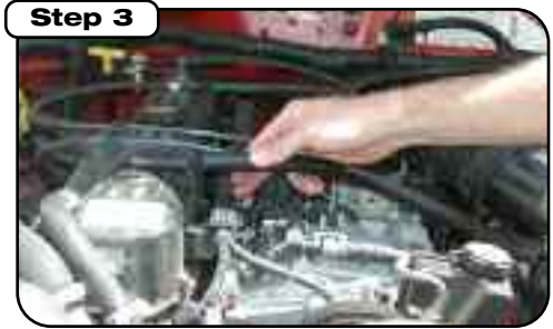
Remove breather tube from valve cover vent.