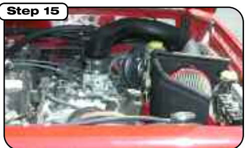
Place enclosed CARB EO sticker on a clean/smooth surface on or near the intake system. EO identification label is required in passing the Smog Check inspection. Make sure all hoses and clamps are tight and that all electrical components are secure.