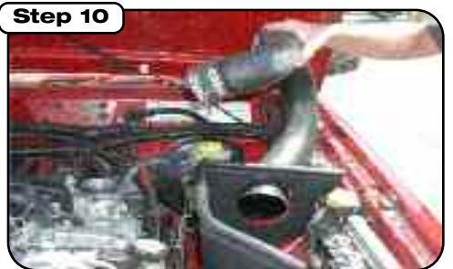
Attach coupler to intake at throttle body end. Then slide intake tube through filter housing starting with filter end of tube.