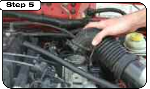
Loosen clamp at throttle body and remove.