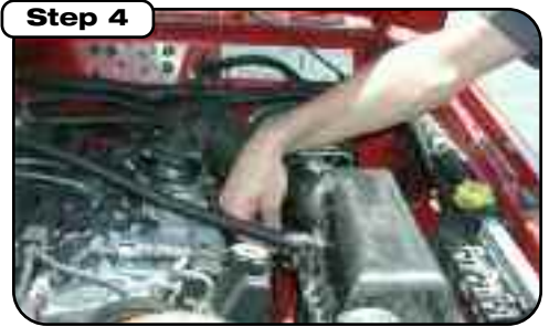
Remove top of OE air box.