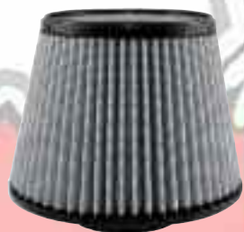
Replacement Filter P/N: TF-9003D