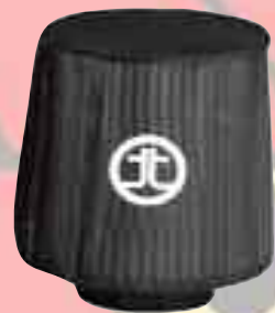
Pre Filter P/N: TP-7011B

Note: Filter Cleaning: When cleaning your Pro Dry S™ filter, be sure to use only "Restore Kit" (Takeda P/N: TP-7015C Pro Dry S™ cleaner only.)