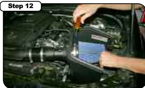
Step 12 Install the pre oiled air filter. Do not use any grease or oil. Secure with the provided clamp.