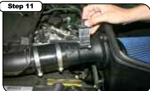
Step 11 Transfer the MAF sensor to the aFe intake tube. Secure with the supplied gaskets, spacers, and screws. Make sure you pay attention to the direction of the arrow on the MAF sensor.