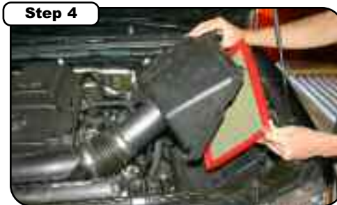
Step 4 Remove the upper portion of the air box and the factory air filter.