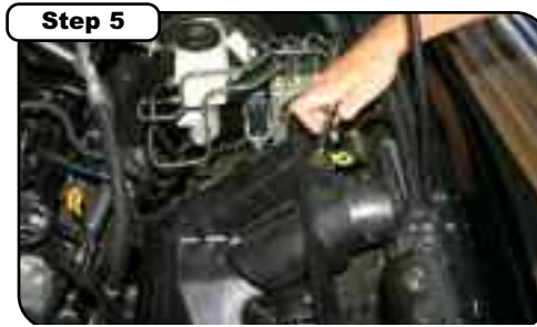
Step 5 Remove the 10mm bolt on the side of the air box set aside for later use. Lift the lower air box up and out of the engine bay.