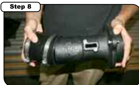
Step 8 Place the coupler on to the intake tube. Do not tighten clamps at this time.