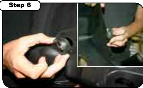
Step 6 Transfer the rubber vibration mounts located on the bottom of the air box over to the new housing.