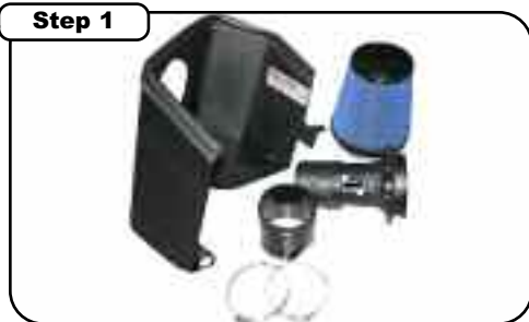
Step 1 Complete kit. Please verify all components are present prior to beginning installation.