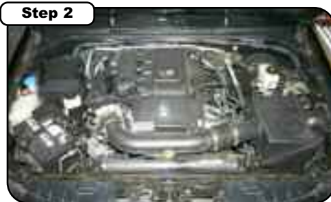
Step 2 Complete stock intake.