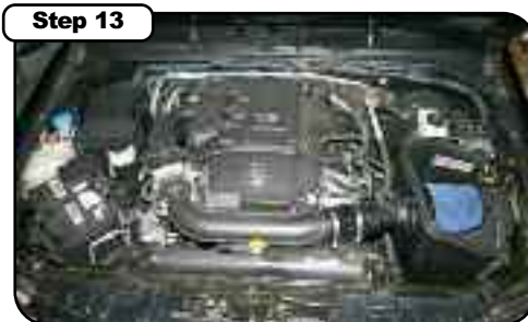
Step 13 Your installation is now complete. Make sure you tighten all clamps and check all electrical connections. Re check periodically.

Retighten all connections after approximately 100-200 miles. Place enclosed CARB EO sticker on or near the device on a smooth, clean surface. EO identification label is required to pass the smog inspection.