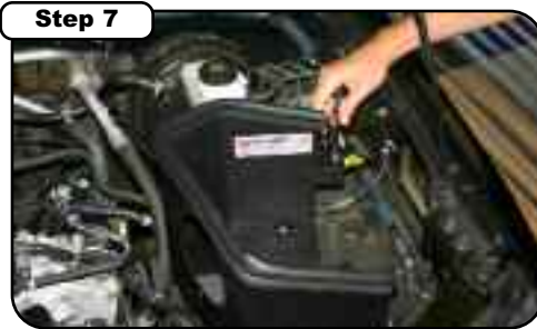
Step 7 Place the rubber trim seal along the edge of the housing. Lower the housing into the engine bay secure housing with the bolt removed in step 5.