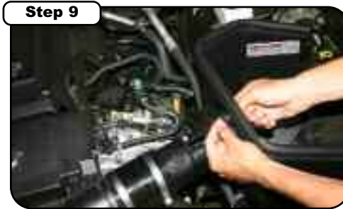
Step 9 Slide the intake tube assembly into the housing. Secure the tube to the housing with the supplied M6 hardware. Tighten and secure the hose clamp.