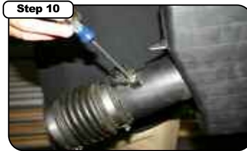
Step 10 Carefully remove the MAF sensor from the OEM air box lid.