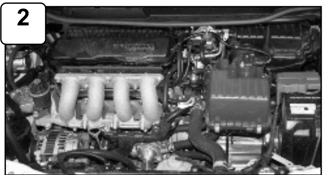
Complete Stock intake. Please disconnect battery terminals before installation.