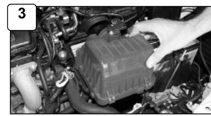
Disconnect MAF sensor harness and remove upper half of air box.