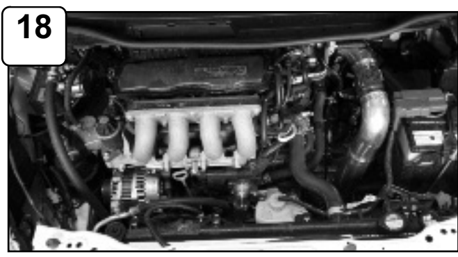
The installation of your Takeda performance intake is now complete. Please check all components and re-tighten if necessary. Thank you for choosing Takeda!