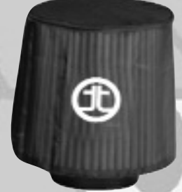
Pre Filter P/N: TP-7011B

Note: Filter Cleaning: When cleaning your Pro Dry 5 ™ filter, be sure to use only "Restore Kit" (Takeda P/N: TP-7015C Pro Dry 5 ™ cleaner only.)