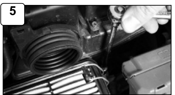
Loosen the 2nd bolt behind the battery mounting the air box, use 10mm socket or wrench.