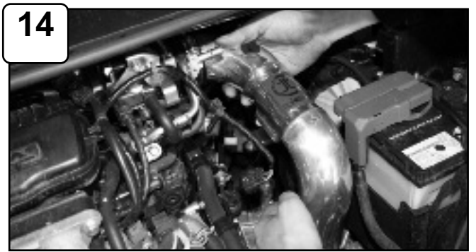
Position tab to mounting point and coupler.