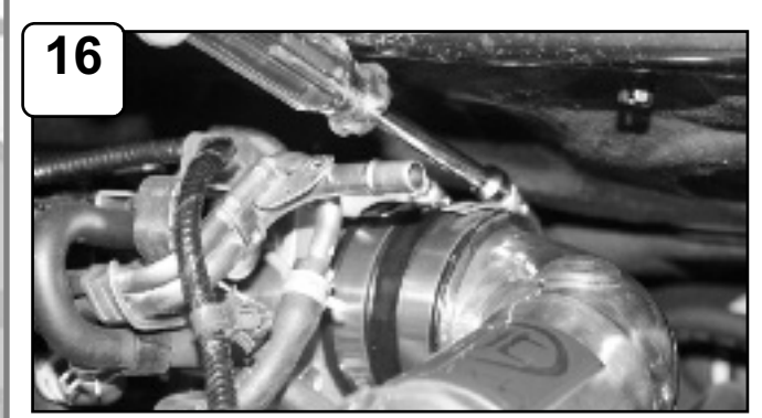
Tighten all clamps using 5/16" nut driver.

For replacement part(s) or "Restore Kit" please log on to takedausa.com P.O. Box 1719 Corona CA, 92878