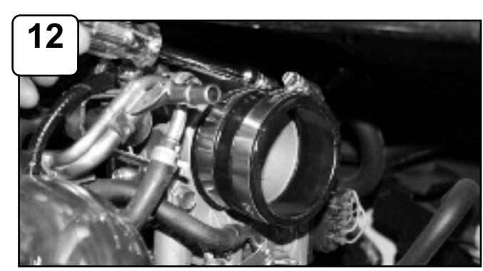
Install straight coupler to throttle body and position using clamps provided. Do not tighten.