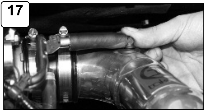
Using the supplied 3/8" elbow, hose and grommet, reattach the crank case line. Re-connect MAF sensor harness and battery terminals.