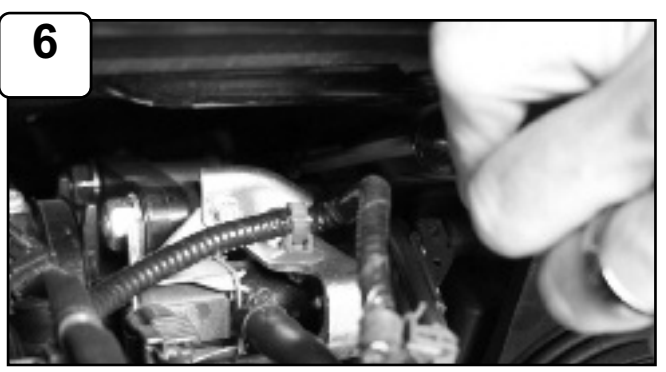
Loosen the clamp on throttle body using phillips screw driver.