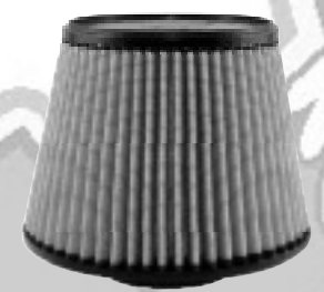
Replacement Filter P/N: TF-9002D