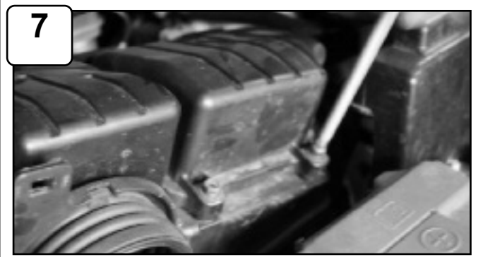
Remove air box cover lid using phillips screw driver.