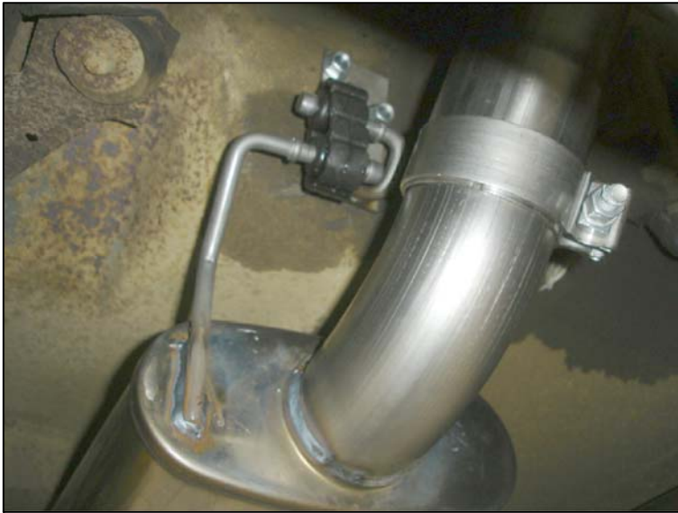
Fig. # 1

Step 5: Slip the over axle pipes over the muffler assembly outlet pipes. Secure with the supplied clamps.