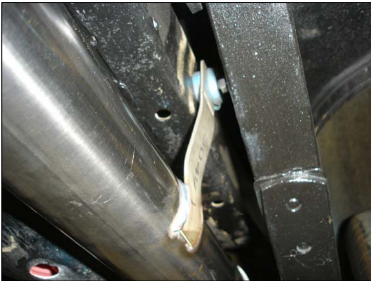
Fig. # 2

Step 7: Once a final position has been chosen for the new system, evenly tighten all fasteners from front to rear. Inspect all fasteners after 25-50 miles of operation and retighten if necessary.