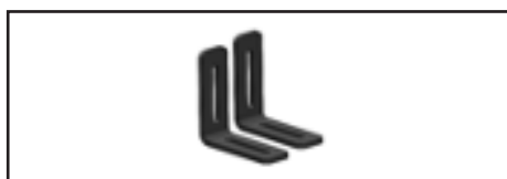
22352 Light Bar L-Bracket QTY:2