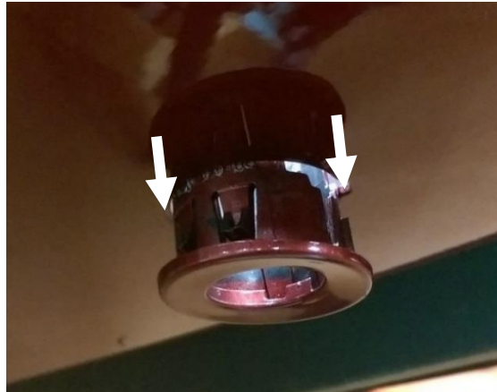
Figure 11.1 Figure 11.1