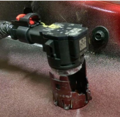
Figure 9 Figure 10

9. Remove the sensor housing from the bumper by depressing the four (4) tabs while pulling outward from the outside of the bumper. ( Figure 11-11.1 )