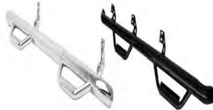
Picture is for sample use, may not be actual bars

STEP 1: Identify the driver and passenger side bars. (The short 45 degree bend at the end of each nerf-step goes towards the front of the vehicle.)