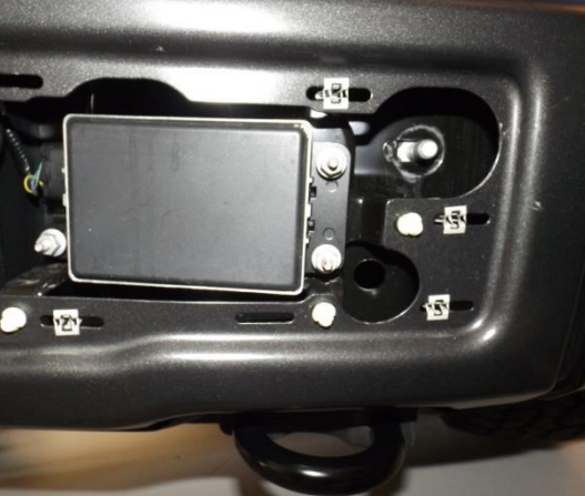
Figure 2a Figure 2b