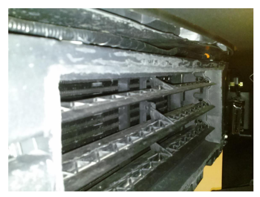
Figure 4 (Louver w/ shroud cut away at base)

<u>be taken not to damage louvers when cutting around the base</u> of the rectangular shroud, a cut off wheel is recommended.