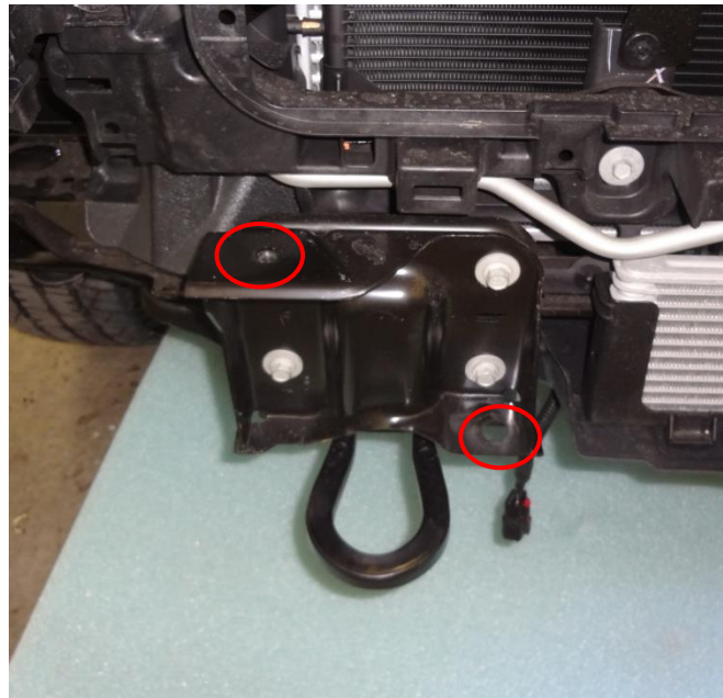
Figure 3a (TOW HOOK & OEM MOUNTING BRACKET)

C. Disconnect electrical harness (Ref. Figure 3a) from vehicle and remove tow hooks. Tow hooks are mounted with one cross bolt through the side and a bolt through the bottom of the frame (Ref. Figure 3b).