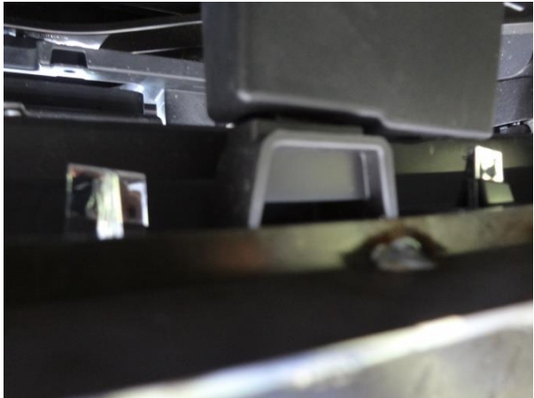
Figure 2c- example of clip holding grill