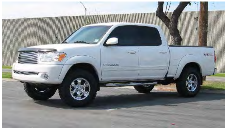
285/70R17 on 17x8 with 4.5" BS shown

*Adjust your headlights whenever your vehicle's ride height is altered.