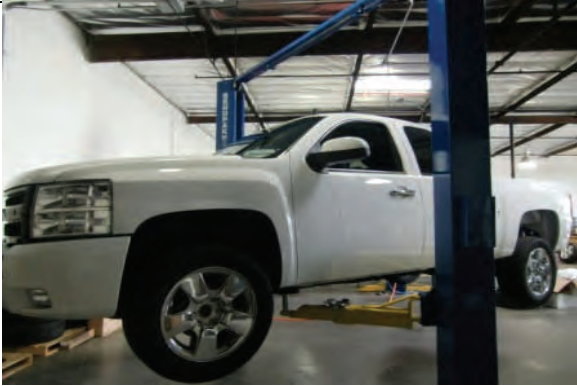
Securely lift front of vehicle and support frame