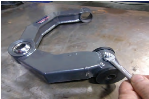
Install zerk fittings