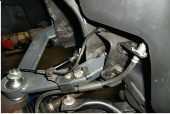
Reattach ABS wiring removed previously onto UCA