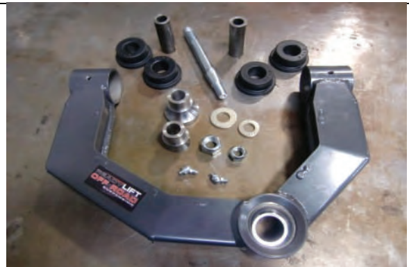
Assemble your new OFF-Road Series UCA with hardware kit