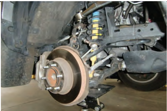
Raise suspension, if necessary, to attach UCA hardware