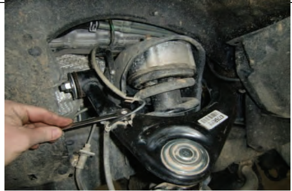
Disconnect any ABS wiring attached to UCAs