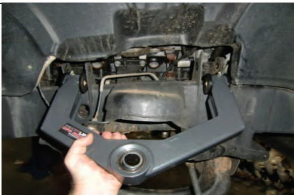
Install new UCA into frame and attach with OE hardware