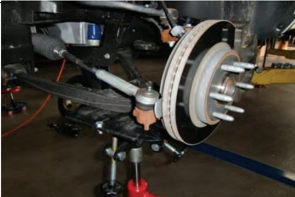
Support lower control arm with floor jack