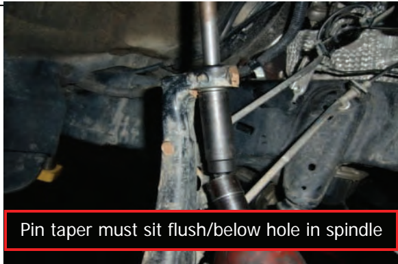
Insert machined tapered pin into spindle and tighten to spec