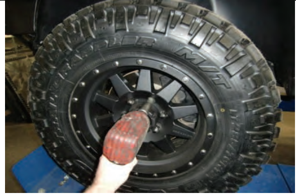
Reinstall wheels/tires and lower vehicle to ground