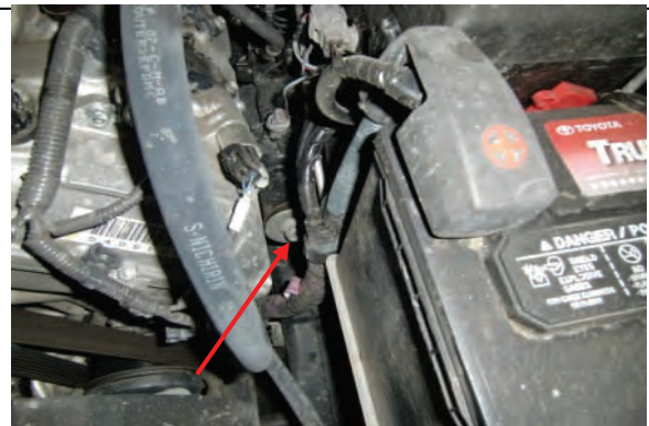
Photo shows UCA mounting bolt and battery proximity