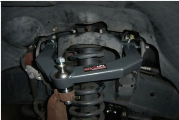
Example photo 2 (Dodge Ram 1500 UCA)