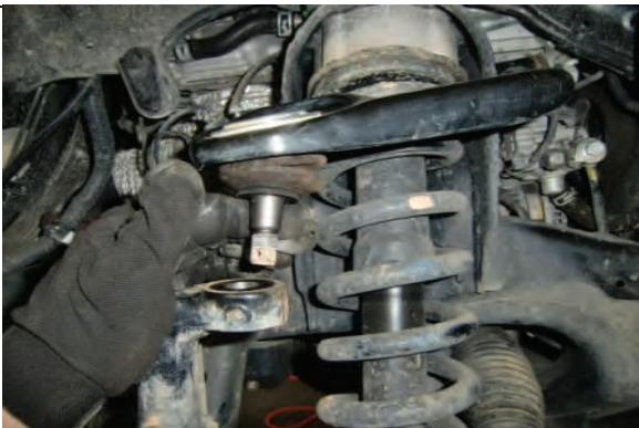
Disconnect upper ball joint and separate from UCA