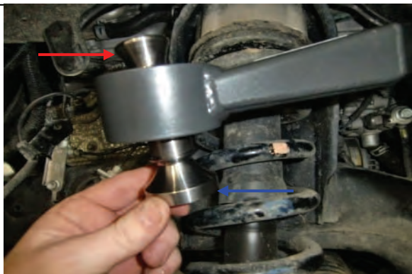
Place upper (sm)/lower (lg) misalignment spacers into uniball