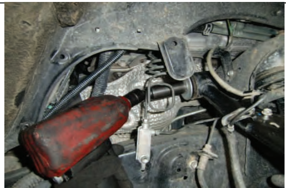
At the frame loosen & remove UCA pivot mounting hardware