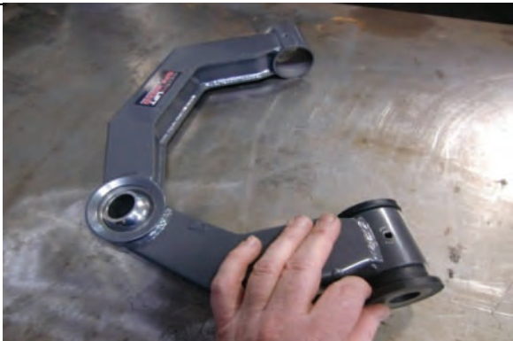
Install Urethane bushings into UCA, DO NOT use lube here.