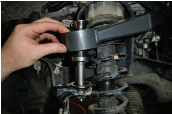
Slide UCA w/ misalign spacers onto tapered pin in spindle