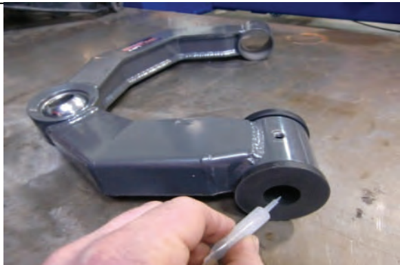
Apply lube to inside of pivot sleeve and insert pivot tube