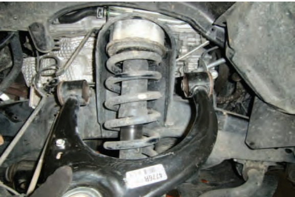
Remove UCA from frame