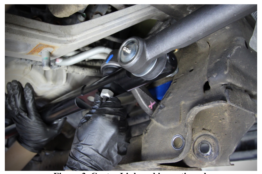
Figure 3. Center Link and inner tie rod.