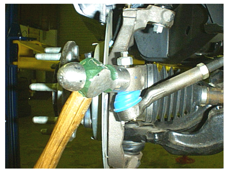
Figure 1. Remove tie rods from spindles.