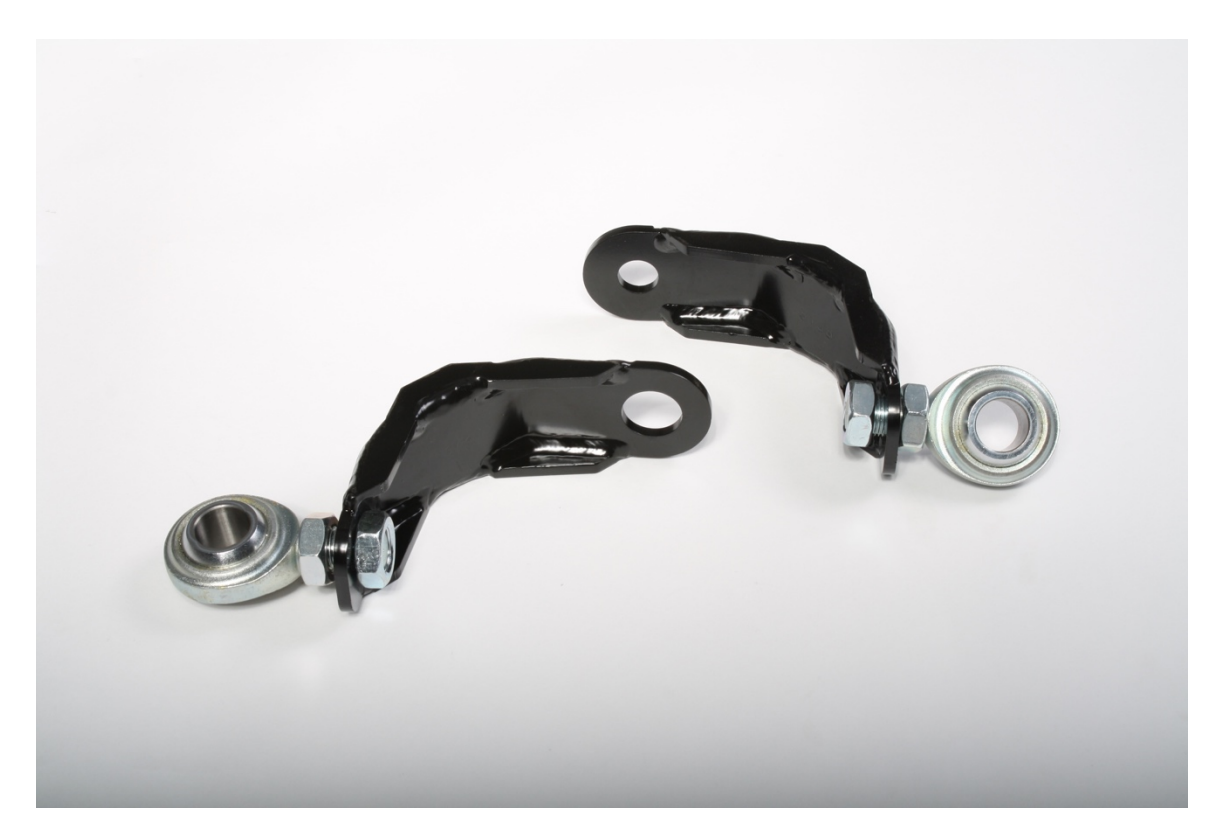
Figure 1: Pitman arm bracket on left, Idler arm bracket on right