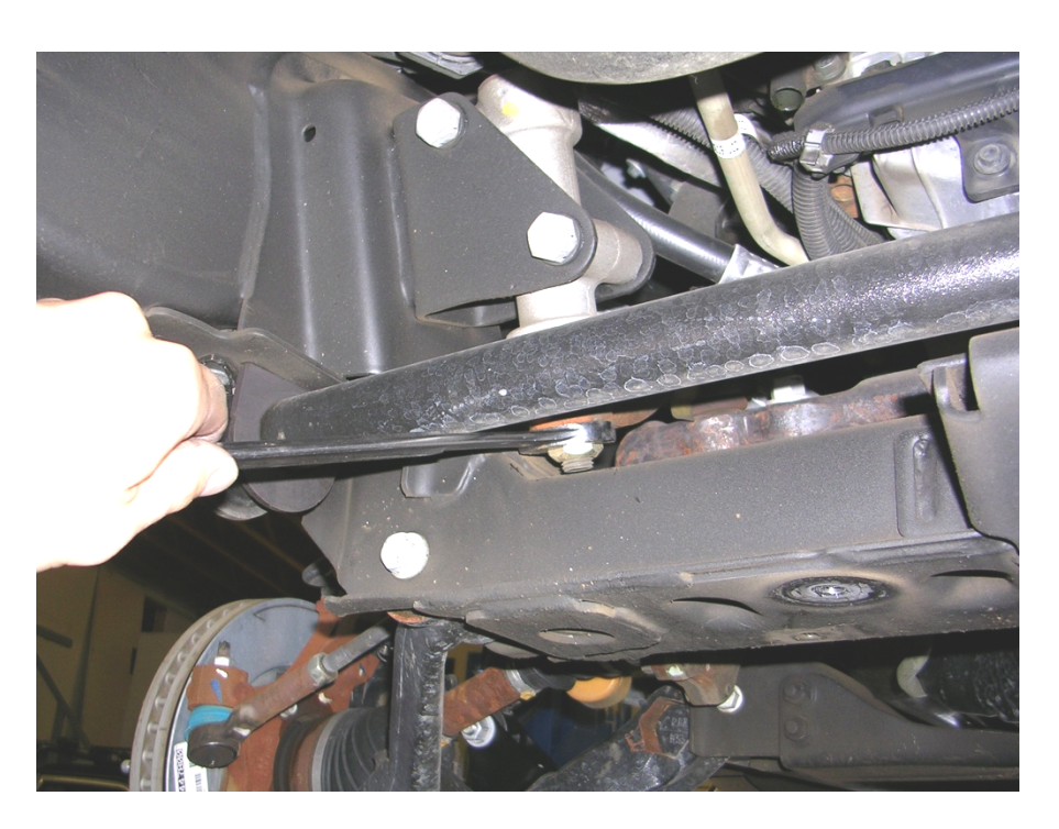
Figure 2: idler arm