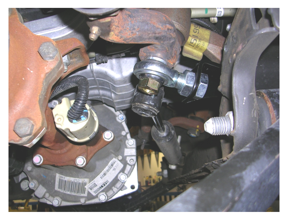
Figure 3: idler arm bracket installed