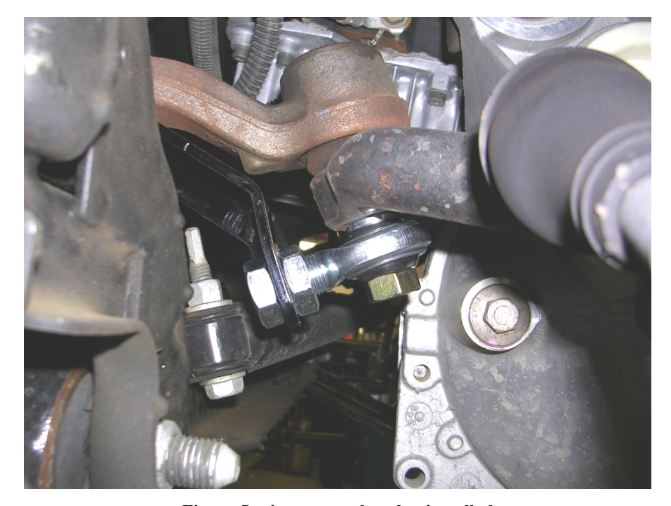
Figure 5: pitman arm bracket installed