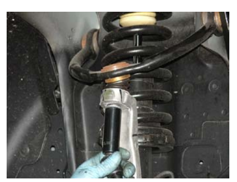
10. Lower the floor jack to relieve all spring tension and remove the lower strut mounting bolt where it mounts through the lower control arm.

6. Disconnect the anti sway bar link at the lower control arm.