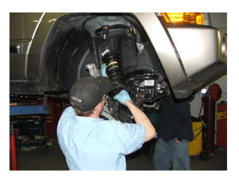
Revised 10 May 06

Attach the lower end of the strut and use the floor jack to raise the control arm and strut up into place, then install the 4 upper nuts. Reinstall the control arm lining them up the cam bolts as near as possible to the original location.